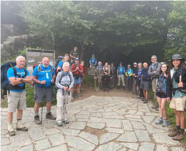
Mulch Mules, ready to roll!