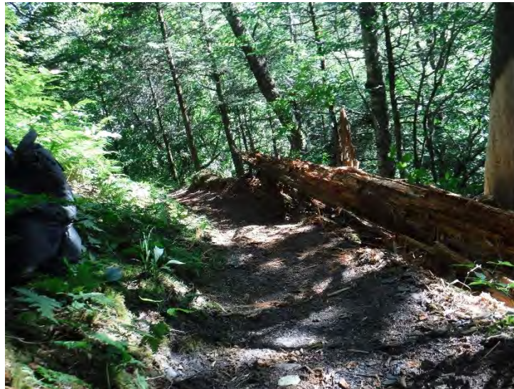
Before and after on Pete's work trip

9/7 - Liz Ehr - Mulch Operations - As an add-on trip on an AT work day, carried 25 pounds of mulch to the Double Springs shelter. Small bin 25% full, large bin 15-20% full, 3 full buckets in the privy. Checked the shelter area - clean, no trash or other issues.