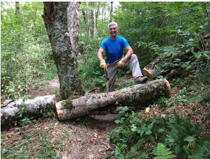
You think that was the saw they used on this tree??