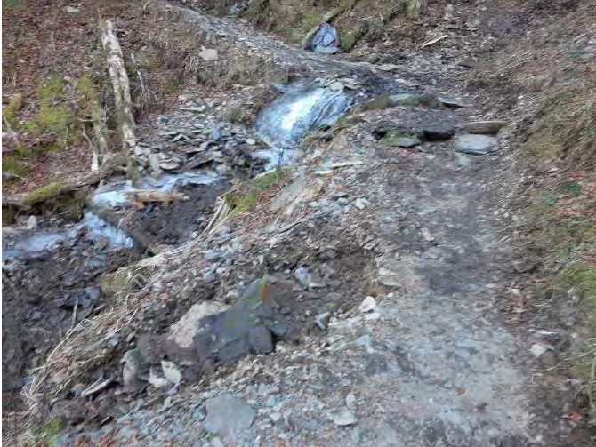
Repair in progress

should make it through this season but I expect that it will need to be replaced next year.