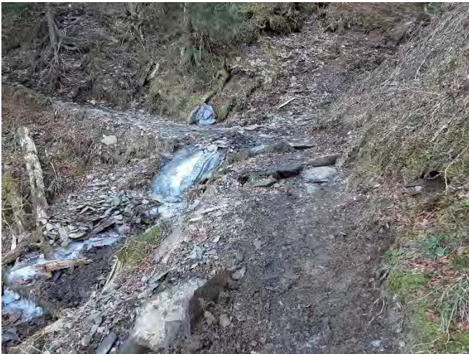
Repair completed

11/19 - Taylor Weatherbee, Bill Pyle, Rick Hughes - Spence (Bote Mt Tr) to Russell Field - Cut a 14 inch oak blowdown located halfway between the shelters. Rick cleaned out 54 water bars starting at Russell. Some of these were waterbars that Jerry Troxler didn't have time to get to earlier this month. We used polyurethane caulking to try to fix the leaks in the Spence roof. We brought a box of 5/16 X2 inch galvanized lag bolts to replace broken ones in the Spence privy. However, the broken off bolts were around the new (middle) location of the throne. I thought it might be best to try to remove the broken off bolts when the throne is moved next to the far left location. I left the box of lag bolts in the far right corner of the tool box. There is a ratchet wrench with the required 1/2 inch socket in the left mulch bin. A vice grip may help get the broken bolts out per Ed Fleming.