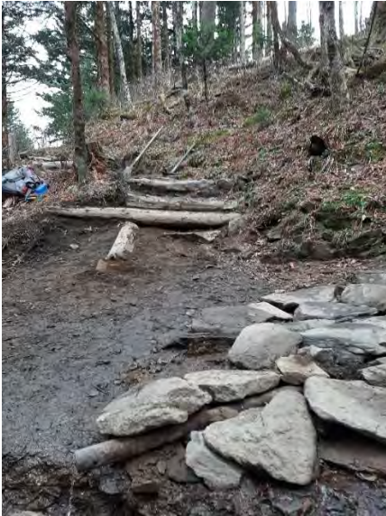
A lot of work done on a very problematic area!

11/22 - Scott McClure, Bert Emmerson - Derrick Knob Shelter - Cleaned up all the garbage and tents that were left throughout the season at the shelter. Cut down all the strings that had been tied at the shelter to dry clothes with and carried all that material out. Cleaned gutters at the shelter, cleaned out fireplace. After we completed work at the shelter I headed south on the A.T. cleaning drainage ditches and water bars out to the end of the top headed to Sugartree Gap. Then came back the shelter and cleaned drainage back to Greenbriar Ridge Trail. Camped overnight in the shelter just Burt Emmerson and myself, no other visitors.