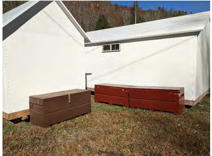
Brown Tool box on left, red mulch boxes on right (view from behind new shed)

spearheaded the effort to build storage racks in the new shed, get all of the tools previously stored at the McNutt barn moved to the new shed, and led the work day on November 7 to clean all tools. Date to do final cleaning out of old shed is TBD.