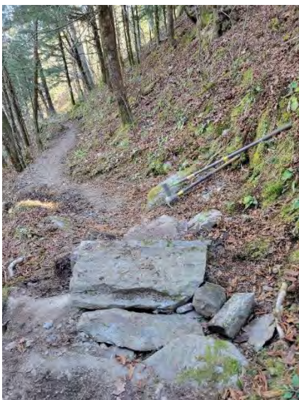
2 big steps installed

11/10 - Pete Berntsen - False Gap to Dry Sluice Gap - Removed low hanging dead branches along route. Planned to replace thinner rock step installed last week but kept it in place and secured it with the much larger rock placed on top (two steps). Completed trail improvements of 75 feet which included adding three additional rock steps, two new water drains, and improvements of two existing water drains.